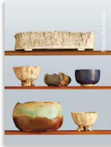
Handcrafted bonsai containers on view in the Urban Green exhibition in the Pavilion.

In conjunction with Art in the Garden exhibition, the Oregon Potters Association will provide one-of-a-kind contemporary bonsai containers for the Urban Green exhibition. Kenji Kobayashi will use these pots to create unique Saikei style bonsai on view and available for purchase as part of the exhibition in the Pavilion. Additional bonsai containers will also be sold in the Garden Gift Store throughout the run of the exhibition.