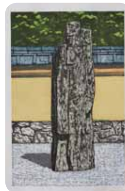
Woodblock print by Walt Padgett

around the corner. Reserve your spot for Behind the Shoji Members-only Opening Party July 22, 7–9 p.m. (Reservations open June 14) This is your opportunity to preview the show and take home a one-of-a-kind piece of art before the show opens to the public on Saturday, July 23. Behind the Shoji features 36 artisans whose work in ceramics, jewelry, wood-working, glass art, woodblock prints, and more is among the best in the region.