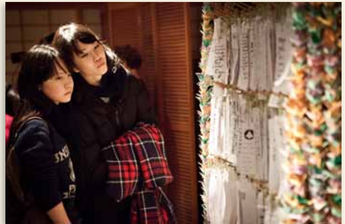
Visitors read wishes on the Wish Arbor.

For more information about how you can help victims, please visit www.japanesegarden.com/japandisasters .