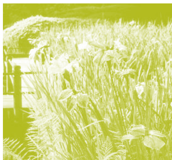
Division of iris from the Garden's own iris beds will be available for purchase at the Plant Sale.