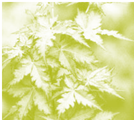
From top: Acer palmatum 'Kawaii'; Acer palmatum 'Orange Dream'; Acer palmatum 'Krazy Krinkle.'

April 1, 5:30-7:30pm Garden Pavilion $10 Members/$15 Non-Members Reservations required, space is limited www.japanesegarden.com/events or (503) 542-0280