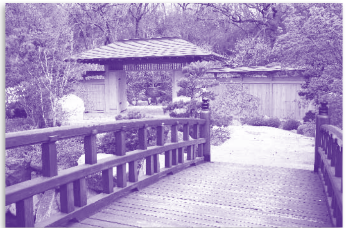
Anderson Gardens