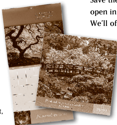
2010 Garden calendar. Buy now and save!

If you're thinking about your holiday shopping list before the rush, our 2010 Garden Calendar is the perfect gift for everyone on your list. Filled with beautiful images of the Garden in all seasons, it's the gift they'll be grateful for all through the year! In the spirit of the holiday season, mention this article anytime before Thanksgiving, November 27 and we'll knock $3 off of every one you buy. That's just $12.95 each and if you add in your member discount, you'll be grateful too! This offer is good for Garden members only.